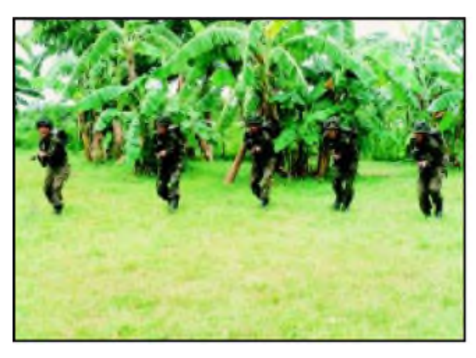
Bayonet fighting training is being imparted to Assam Rifles recruit in Assam Rifles Training Center and School, Dimapur (Nagaland)

6.11 Known as 'Friends of the Hill People',