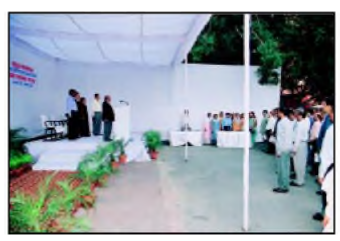
Secret^ary (BM) administering pledge t^o the employ'ees on the occasion of Vigilance Aw^arencess Week

8.14 With a view to expediting the pending vigilance cases, the Ministry keeps a close watch over all cases pending at different stages including the cases pending in its attached and subordinate offices. These organisations are reminded periodically to expedite disposal of the cases/inquiries.