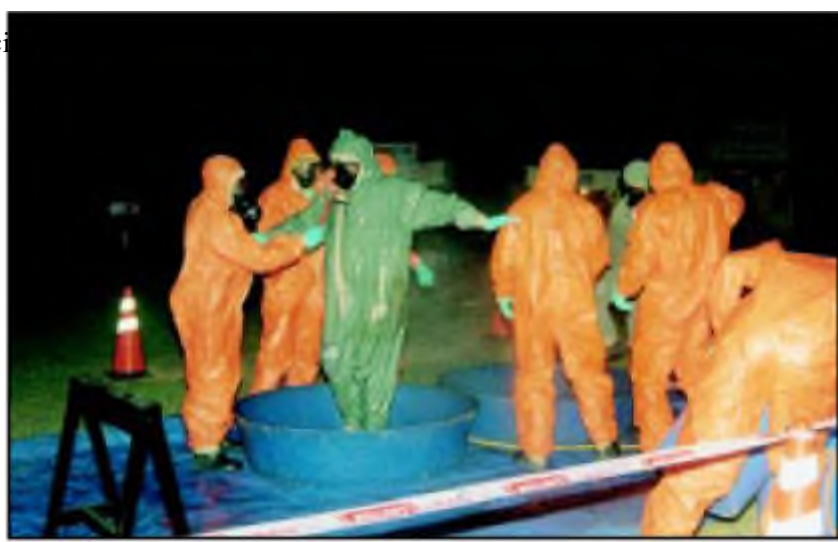
Mock dr^l^l of Civil Defence Operations during nuclear emergencies

7.14 Since the Government of India has instituted the Nuclear Command System, the college has upgraded its training programmes to develop skills of first responders in the event of a Nuclear attack or deployment of a Radiological Dispersal Device(Dirty Bomb). On the occasion of the Foundation Day of the College, mock drills depicting Civil defence operations after radiological incident have been carried out twice, involving more than 150 people. The College has introduced the Biological incident first responder training programme from the year 2005 to prepare the paramilitary forces in handling Biological terrorist incidents.