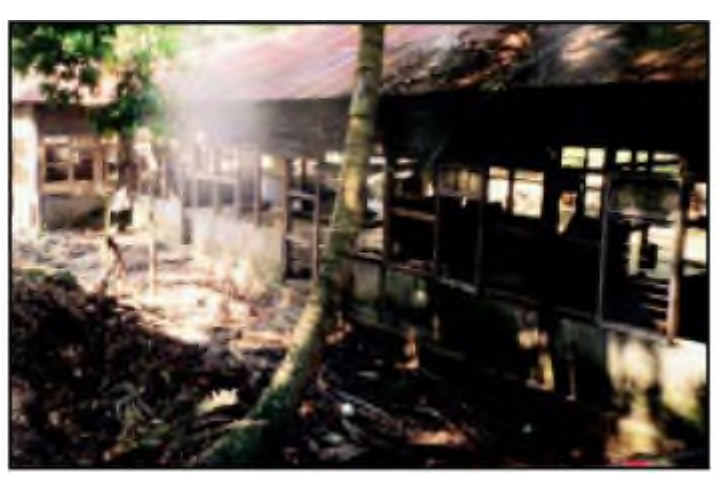
Destruction caused by Tsunami in Nancowry