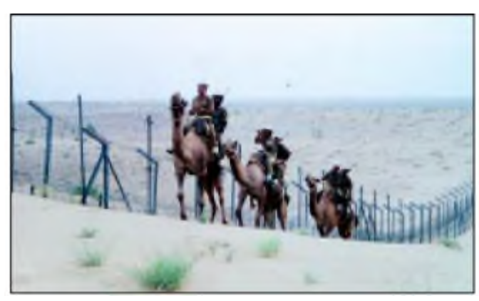
Camels patrolling Indo-Pak Border in Rajasthan

Gujarat and Jammu sectors. Over 1712 km out of the total length of 3287 km of Indo-Bangladesh border has also been fenced and a pilot project of flood-lighting along 126 km has been taken up during the current financial year. To check antinational activities and improve security along Indo-Nepal and Indo-Bhutan borders, Sashtra Seema Bal has been deployed on these borders. It has also been decided to fence certain sensitive segments of Indo-Myanmar border.