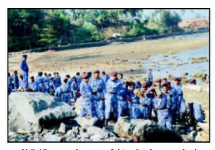
99 FA^F personnel repairing Culv^ert Road near sea, South Poin^, Port Blair (A & N), India

4.77 Two coys. were deployed at Nagapattinam, Kota and Manakudi (Chennai) on 29th December, 2004. In addition, 10 coys were deployed in A&N Islands from December 31, 2004/ January 1, 2005 for rescue and relief work. The CRPF personnel were engaged in evacuation, recovery of dead bodies and burial, besides assisting civil administration in the relief, rescue and rehabilitation work. Relief materials (food grains, blankets, tents) were also provided by CRPF to the A&N Authorities.