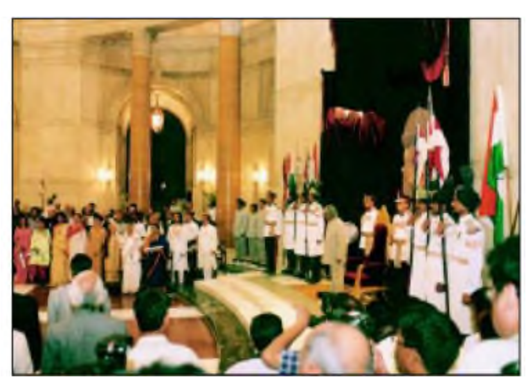
Investit'ure cerewony for cowferwent of Padma Awards

8.5 Padma Awards announced on Republic Day, 2004 were conferred by the President at an Investiture Ceremony held at Rashtrapati Bhavan, New Delhi on June 30, 2004. The awards were conferred on 96 persons (Padma Vibhushan-3, Padma Bhushan-19 and Padma Shri-74). Out of the 96 recipients, 21 were women. The names of the recipients are available on the Ministry's website.