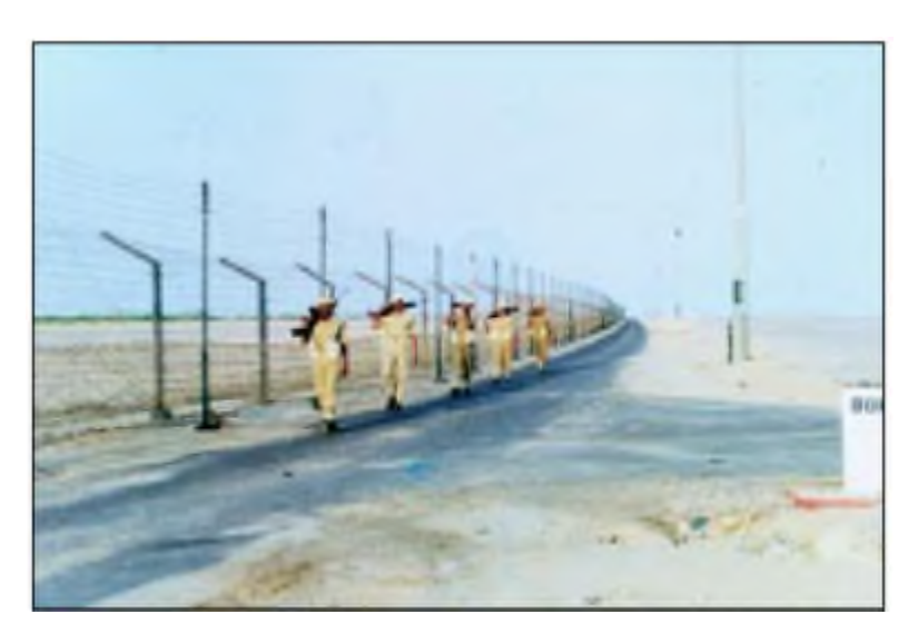
Foot patrolling along Indo-Pak border in Rajasthan

4.87 In order to check anti-national activities from across Gujarat border, the Government has approved a comprehensive proposal for the construction of fencing, flood lighting on a raised embankment, construction of link roads, Border Out Posts and border roads in 310 kms of Gujarat sector. So far, 68 kms of fencing and 64 kms of floodlighting has been completed. National Building Construction Corporation (NBCC) has been allocated fencing works in 124 kms stretch to expedite the work.